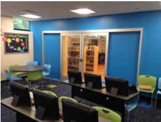
Remodeled Technology Center Funded by the 2014 September Spectacular Paddle Raise