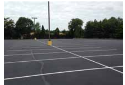
The parking lot of Byrider Hall was sealed and striped