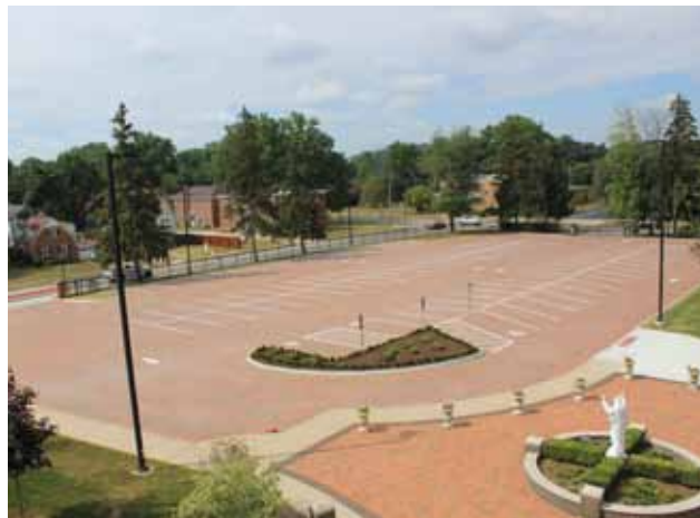
The Completed New Brick Parking Lot! Funded by the generous donors to the Brick Fund and the Rooted in Faith Campaign