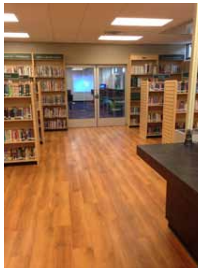
Hamlin Library received a new floor and is now connected to the Technology Center