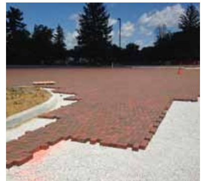
Construction view from the entrance, looking towards the playground.

A Few Brick Facts: There were 25 semi-trucks of bricks delivered There were 18 pallets of Ohio Belden Bricks on each truck Each pallet had 408 bricks stacked on it The parking lot required nearly 183,600 bricks, 4.5 bricks cover about one square foot