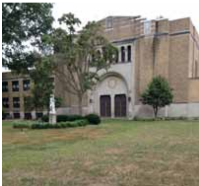
Removed concrete circle drive on Mull Avenue to help with water mitigation

This summer has been a flurry of activity on campus, both inside and outside. While the largest project was the restoration of the Brick Parking Lot, there were many other projects taking place throughout the campus this summer as well. Take a look at our changes: