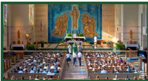
School Mass 2012