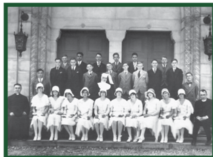
First Graduating Class 1930