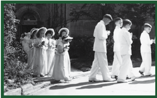
First Communion 1948