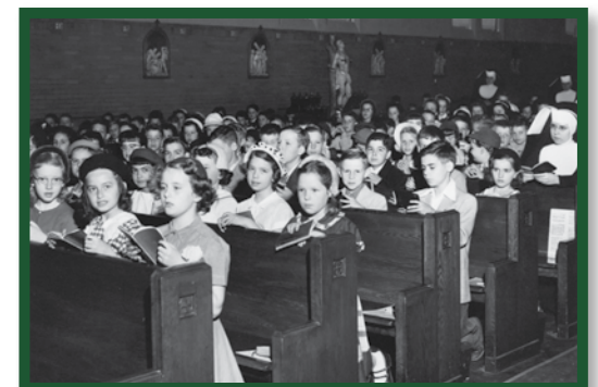
School Children Celebrating Mass