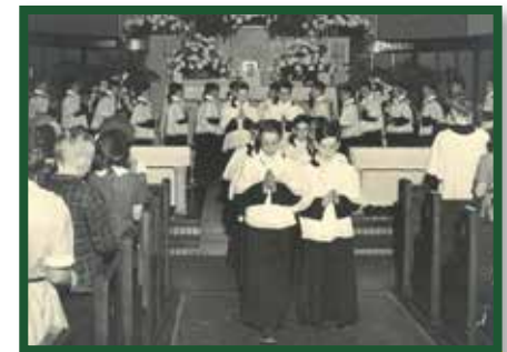
1953 Altar Boys