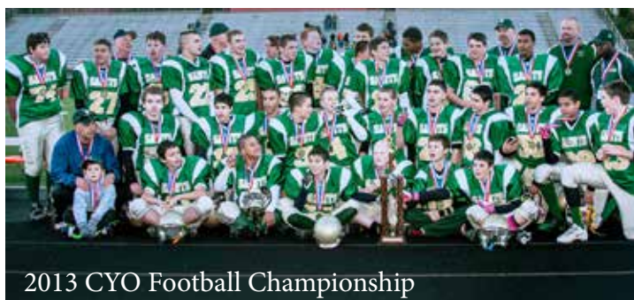
2013 CYO Football Championship