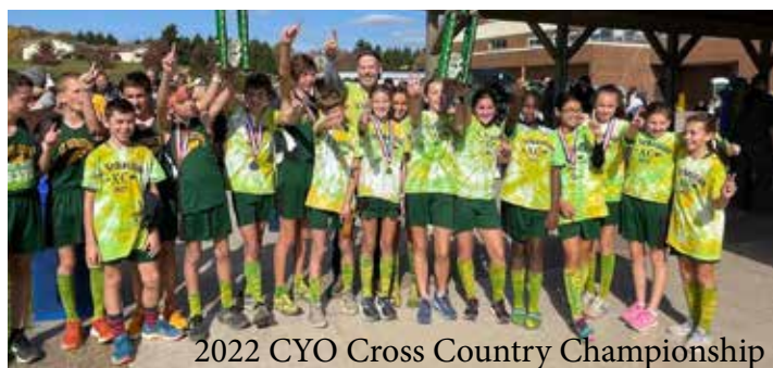
2022 CYO Cross Country Championship

The Athletic Booster Club has been supporting our students, like those pictured here, for 25 years by providing uniforms and equipment, caring for facilities, and keeping fees low to help families and encourage participation. Thanks to the support of the Booster Club, the St. Sebastian Parish School athletic program boasts a tradition of both high participation and great success.